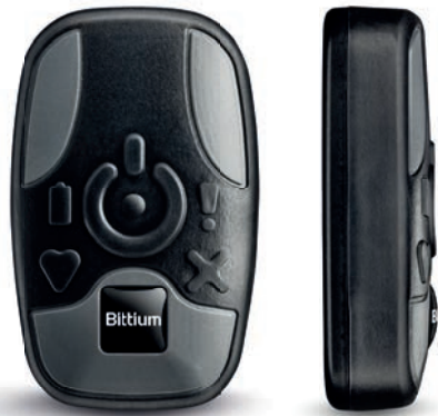
Bittium Faros™ 360 waterproof