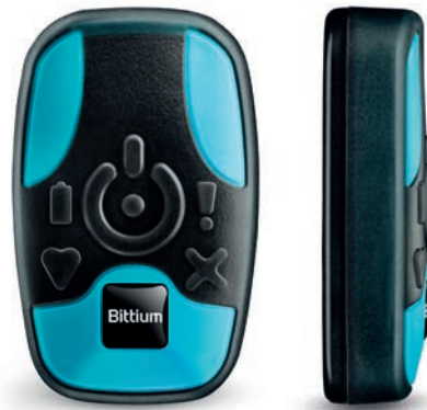
Bittium Faros™ 180 waterproof

Bittium Faros™ 360 package: Faros™ 360 waterproof sensor, 5-electrode cable set for 3-channel ECG, bag of Ambu electrodes (BlueSensor VLC, 25 pcs), Micro-USB cable, user manual, eMotion EDF Viewer software, Faros™ Manager software to adjust sensor settings.