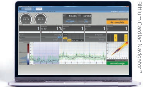
Bittium Cardiac Navigator™

Bittium Faros™ devices are delivered with software for changing the measurement settings of the device and to view the recorded ECG data.